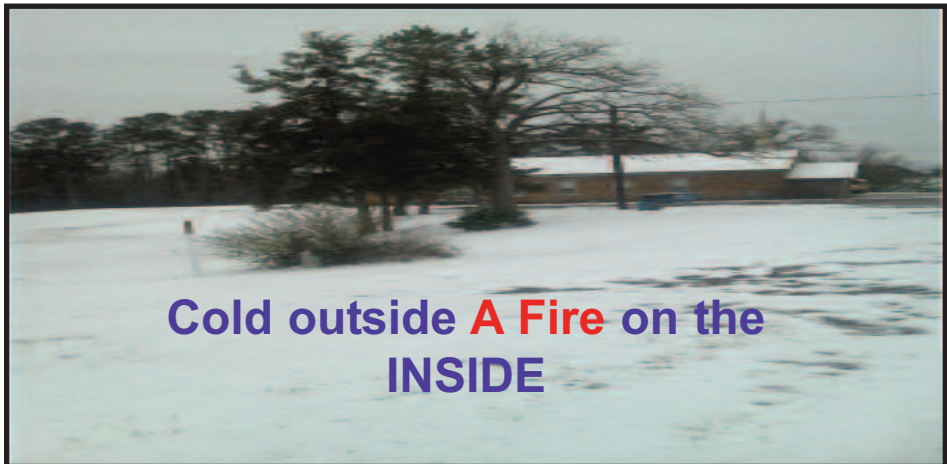
Cold outside A Fire on the INSIDE