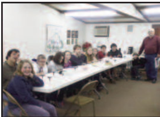
SEE PAGE 2 for Pastors Sermon "I THOUGHT"

Our Youth are growing in number, Come be apart of this great youth group