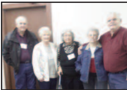
Our Home Bound Ministry Team

If you are an elderly person that is shut in and need someone to talk to or to pray with you in the Colmesneil or Woodville area please call us at 409-837-5706. We have people that will come and visit with you and talk with you in confidence.