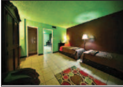
Remodeled facilities at the Phoenix Dream Center provide living quarters for up to three foster youth in one area.

DCLY participants are required to take classes at the Dream Center from a wide curriculum list that includes such topics as anger management and addic-