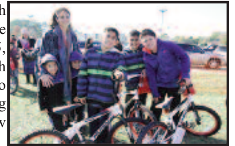
The smiles say it all! The Ortiz family, featuring three current and two future Reed students, celebrate the bike giveaway

energy and your heart, it means more. Our family is a part of every one of these bikes."